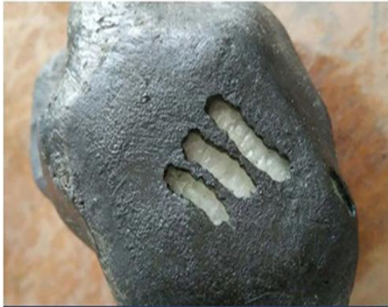
Under normal Light