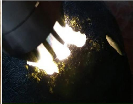
Observed under yellow light