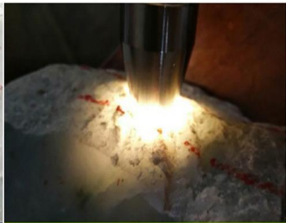
Observed under yellow light

Yellow light source is close to natural light, no reflection when irradiated, conducive to the naked eye to observe the color of jadeite.